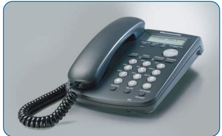
Panasonic's KX-HGT100 SIP Telephone