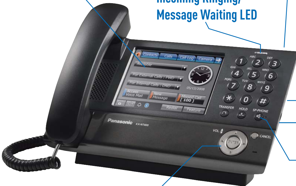
Easy Navigation Key