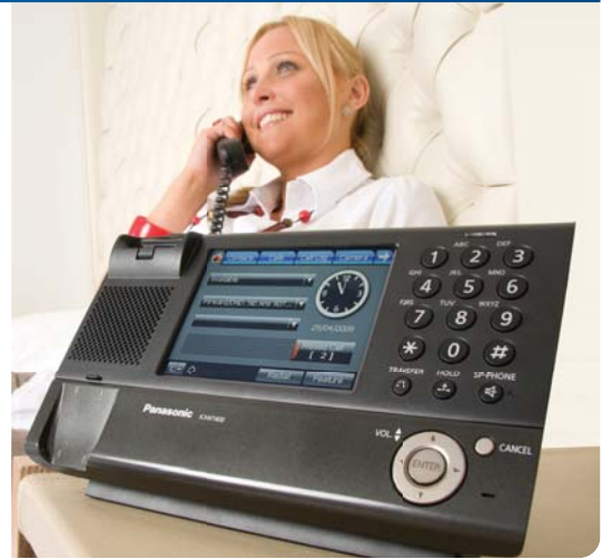
KX-NT400 EXECUTIVE IP TELEPHONE BROCHURE